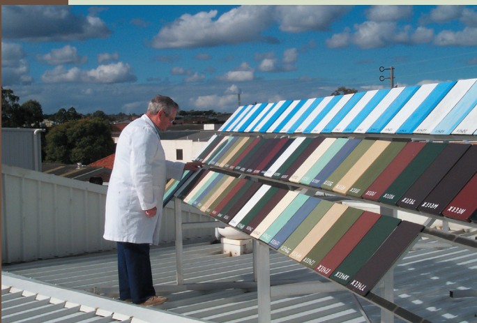
One of two exposure racks located at Durablex Paints