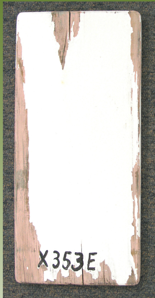
*3 coat alkyd system after 5 years roof exposure (note timber decay).

The alkyd based products were all from a major well known manufacturer.